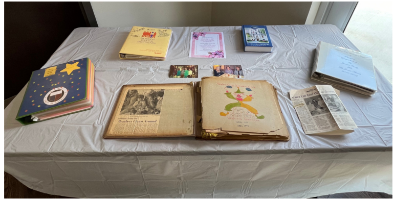
ACWC History table