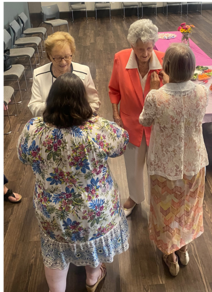
GFWC 55-year Service Pinning