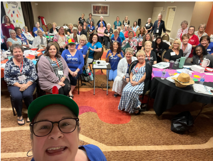
2024 GFWC Georgia LEADS Graduates