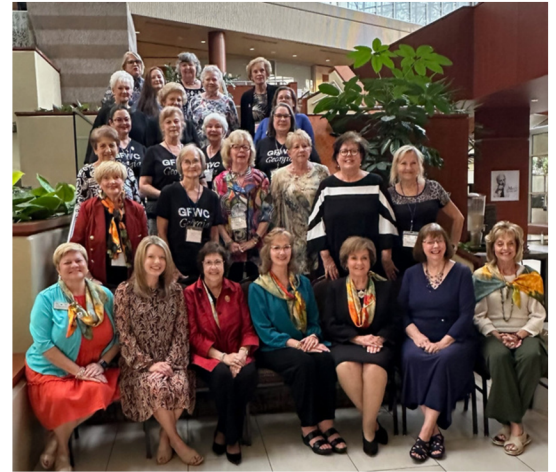
GFWC Georgia Club Members and GFWC Leadership